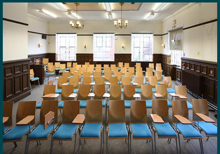
Lecture Room G12